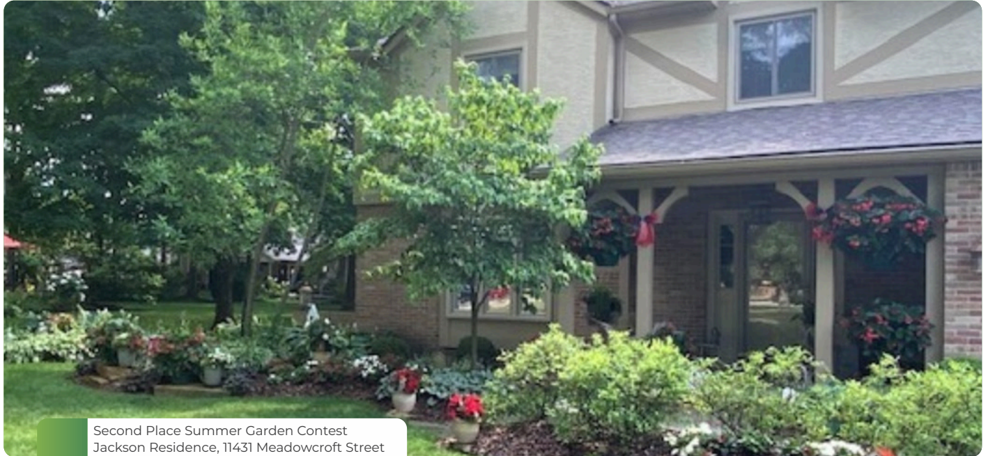
Second Place Summer Garden Contest Jackson Residence, 11431 Meadowcroft Street