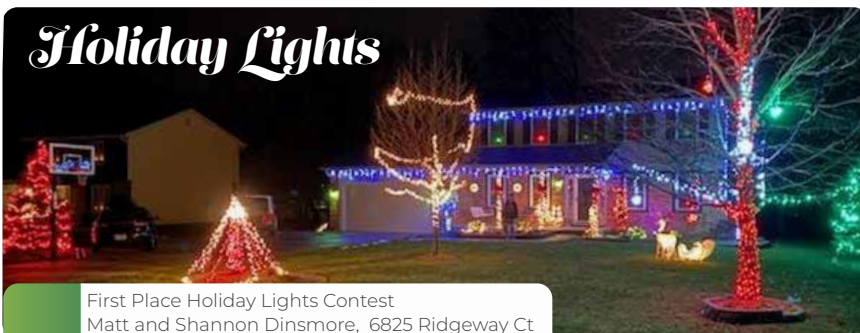
First Place Holiday Lights Contest Matt and Shannon Dinsmore, 6825 Ridgeway Ct